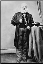
Pio Pico, one of the most famous Californios

Did you know that the State Board of Equalization once established assessed values for all properties in California? However, in the